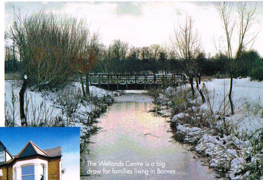
The Wetlands Centre is a big draw for families living in Barnes

A mini-Richmond, Barnes has both the river and 120 acres of woodland to enjoy. Traditionally, this area has appealed to City workers with school-age children who have been living in Wandsworth or Fulham and are looking for a home with more room to spread out into. The Wetland Centre – designated as a Site of Special Scientific Interest – allows young children to learn more about the growing local water vole population and to squelch through a mangrove swamp. It has educational films, a gallery and a cafe. The village also has the obligatory farmers' market and the Bulls Head, a well-known jazz venue that hosts gigs in the back room. Savills (020 8939 6900; savills.co.uk) is selling one of the distinctive double-fronted houses on Castelnau, which backs on to the Wetland Centre, for £5.5m (right). It comes with just under 6,000 sq/ft of space divided into six bedrooms with a 96-foot garden. For something a bit more modest, the agency is also selling an attractive three-bed Victorian house which comes with roof terrace off the main bedroom in a cul-de-sac for £949,950 (below right).